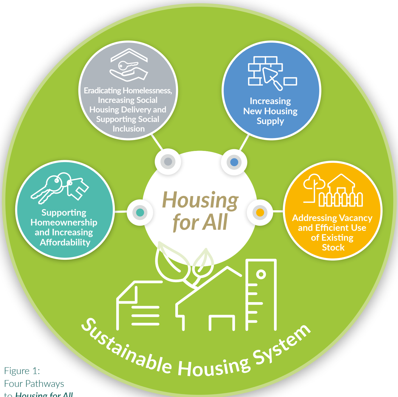
Figure 1: Four Pathways to Housing for All

A summary of each pathway, its main challenges and immediate actions is set out below.