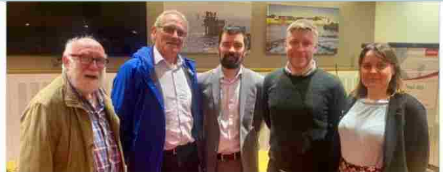
Meeting with Minister Joe O'Brien September 2022