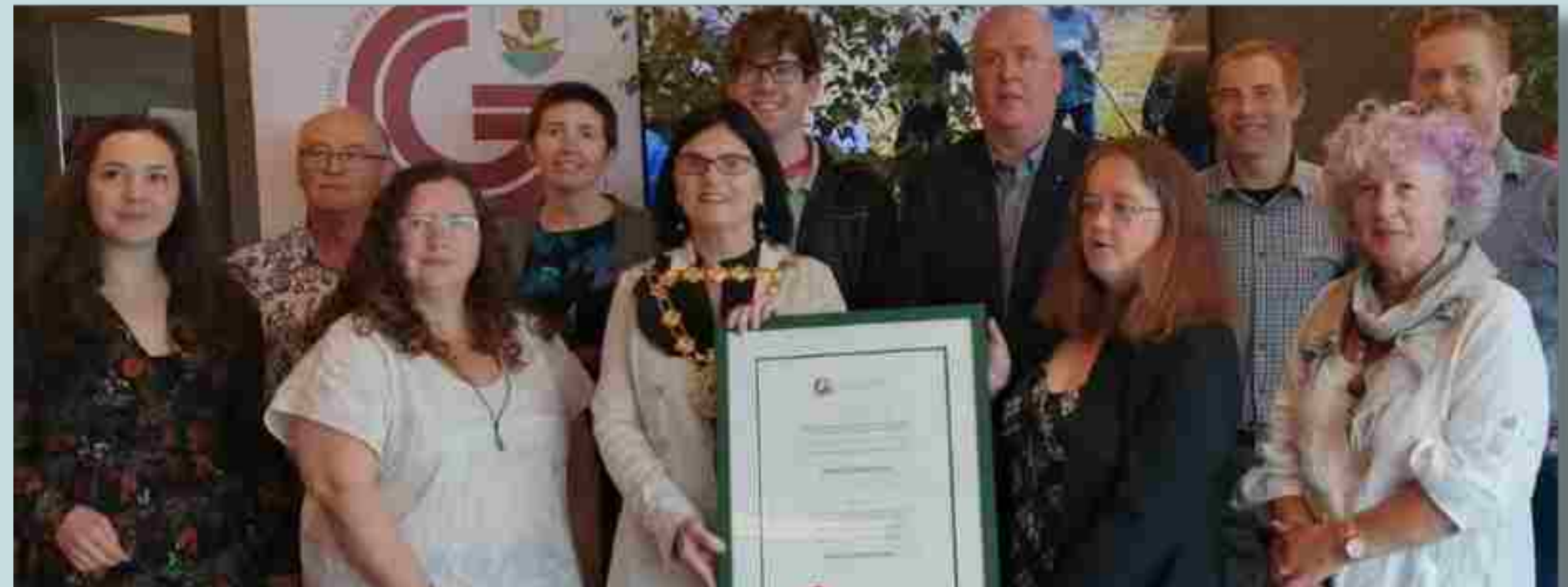
Mayoral recognition of Friends of Merlin Woods and Terryland Forrest Park Alliance - June 2022